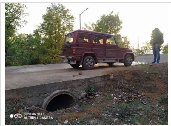
A road-culvert built in Satrenga of Korba block. This road is largely used by tourists and not an affected area by mining. Built at a cost of Rs. 20L