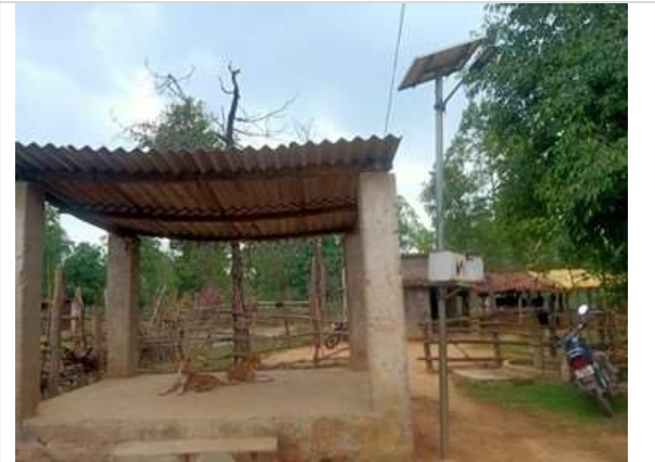
Street Light in Chachiya - The battery is defunct so the purpose for which it was installed is not achieved. Replacement battery needed