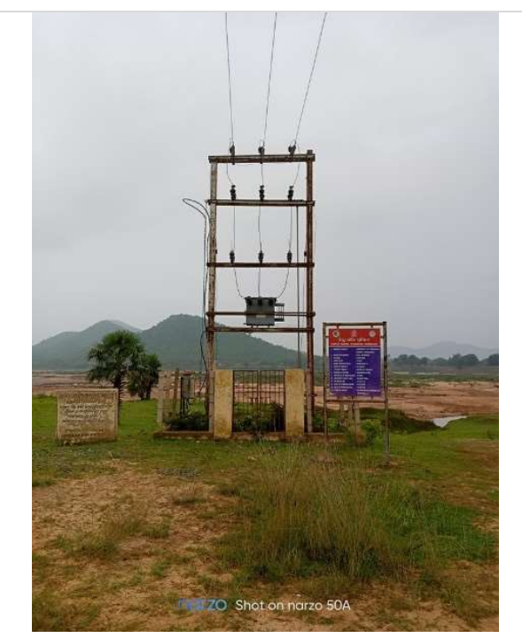
Community lift irrigation project San gugua -2 in Bonaigarh Block damaged. Repair required