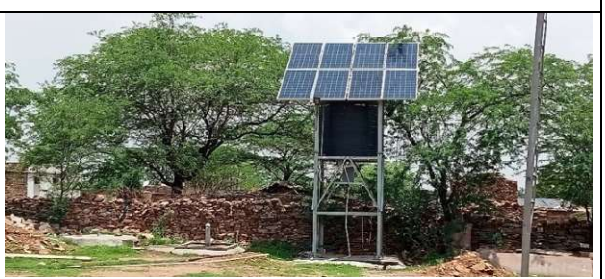
Built at a cost of Rs. 3 lakh, It is defunct as the bore doesn't have water. This project in Guwar, Loicha Panchayat in Bundi is lying defunct. People also complain about small size of water tank.