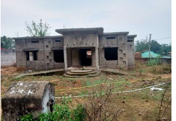
Panchayat sachivalay construction left incomplete in Village and Panchayat Kudmura. It is being built at a cost of Rs. 16.45 Lakh and now with rising inflation the cost will increase.