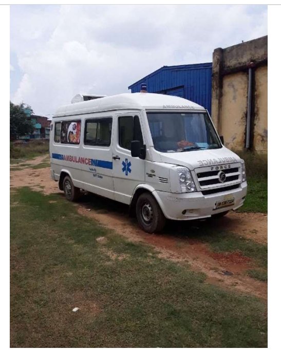
An ambulance in Tandwa block of Chatra