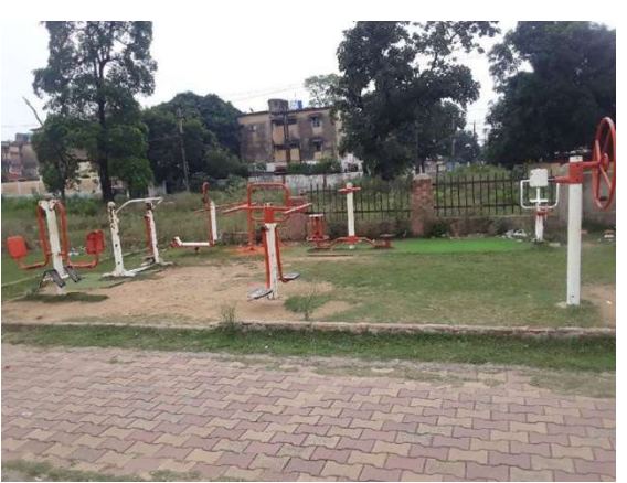
Open Gym, Sector 4F, Bokaro