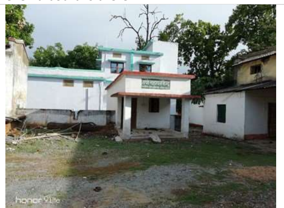
Elephant Assistance Centre (Lemru, Korba) built at a cost of Rs. 5L by forest department in an area not affected by mining. It looks deserted.

Environment Awareness Centre looks deserted, Gahaniya Village, Bela Panchayat, Korba. Not even a board is there