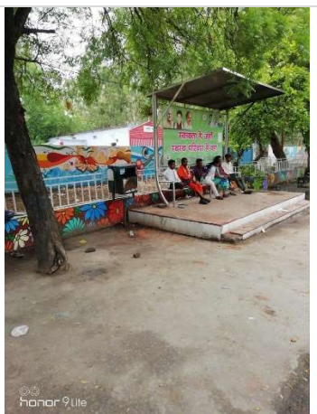
Around 25 such bus stops costing Rs. 7.5 Lakh each have been built by Municipal Corporation Korba costing Rs. 1.87 crore cumulatively. It can seat only 6 six people. This photo is of ITI Tansen Chowk bus stop