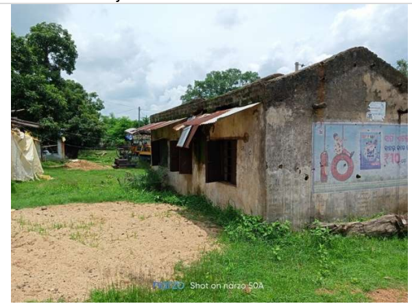
Taldihi Upper Primary School – No work has been done, S Bolang of Bonaigarh Block