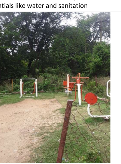
Open Gym in Sector – 2, Bokaro