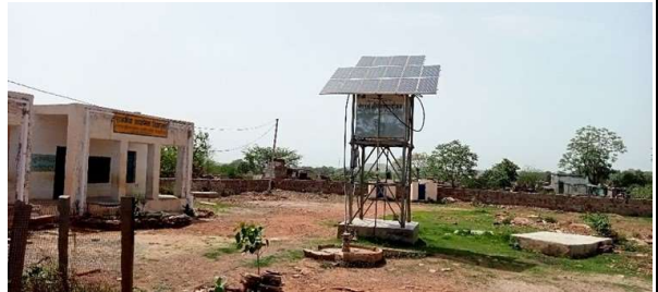
This scheme in Dhaneshwar Village of Talera block performs poorly as water supply is low