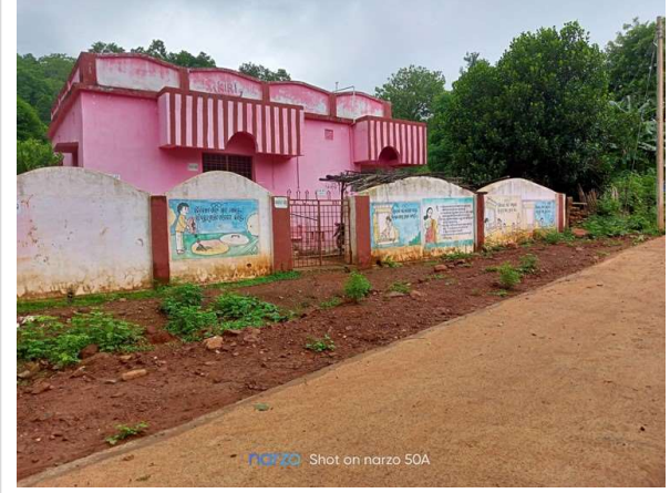
Kiri Village of Mahulpada Panchayat (Lahunipada Block), Anganwadi Centre Work – Village needs attention on all works