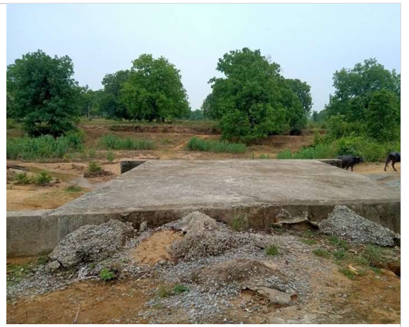
Delayed/Left Incomplete – The construction work for road and culvert project in Village Jilga