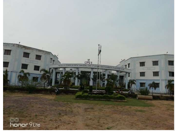
Education hub Syahimudi - Built at a cost of Rs. 240 crore this infrastructure is being used partially. It is built by Chhattisgarh Housing Development Board. There are four buildings – 1 CIPET, two primary schools and one prayas residential school.