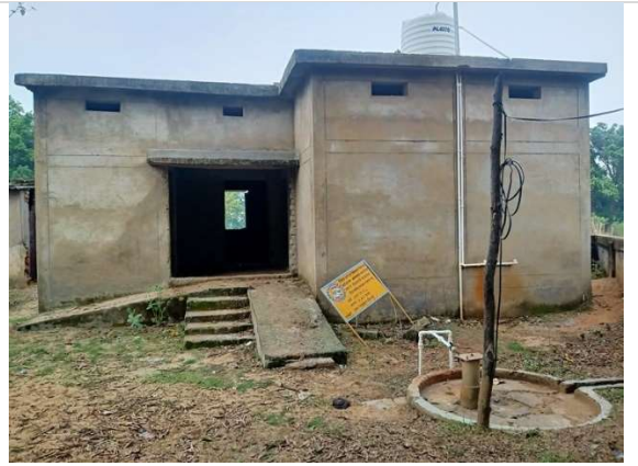
Delayed – This Anganbadi in village Jilga. It's a 2017-18 project but it is still awaiting completion, people prey it is built fast