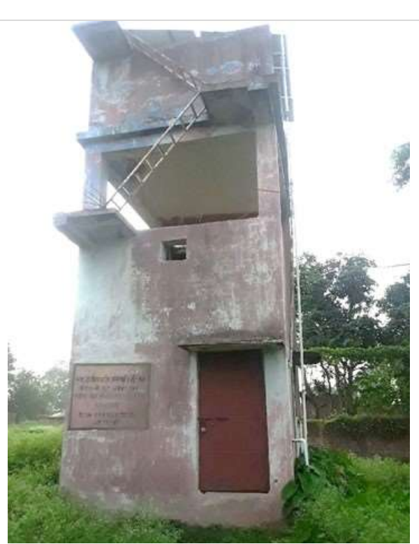
Chandlaso WS Scheme (Kudu Block of Lohardaga District) is not working for last 18 months due to faulty submersible pump. It must be restarted as it is useful for the people