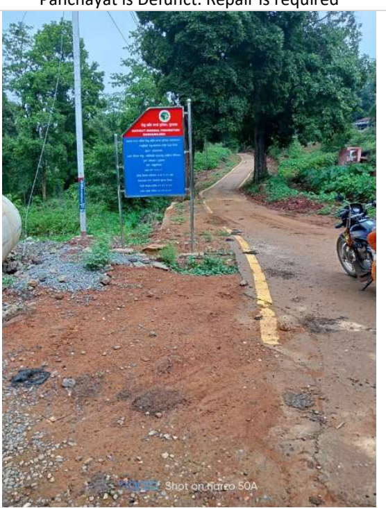
Construction Of road & CD work from Tentulikhunti to Uskela (Lahunipada) is incomplete.