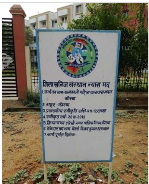
Working women hostel, Korba City