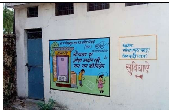
Roof leaks during rains of this facility in Gopalpura Panchayat

This school of Badfu in Ganeshpura Panchayat of Talera Block is awaiting completion from last 4 years