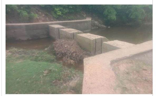
No benefit to the people and the quality is also bad? Stop Dam built across Kaccharpara Nallah, Village Dumar Kacchar, Pali