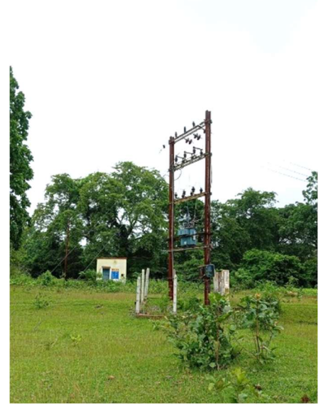
Kumundi lift irriagation project of Mahulpada Panchayat is Defunct. Repair is required