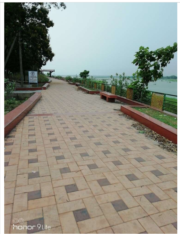
Riverfront Darri Barrage: Total cost of three projects is Rs. 1.88 Crore? It looks deserted and is not of relevance to mine affected communities.