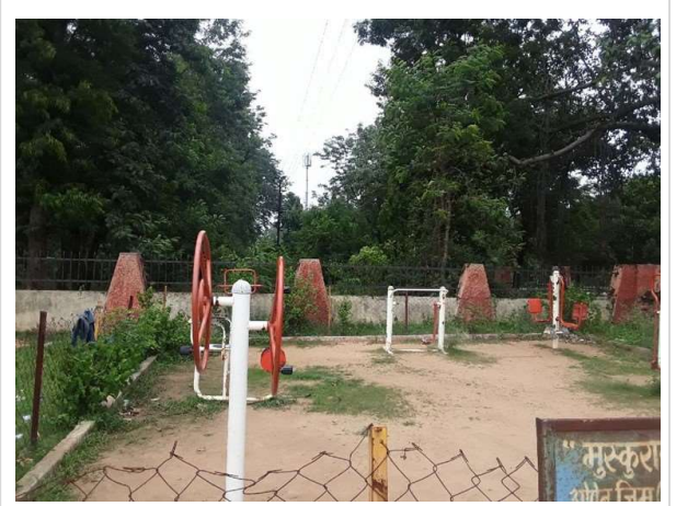
Open Gym in Sector – 5, Bokaro Jharkhand Audit has already pointed to these open gyms as incompatible activities done from DMFT fund.