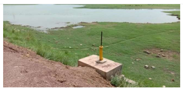
There is a need to strengthen this water harvesting system in Village Sodekela of Pursour Block.