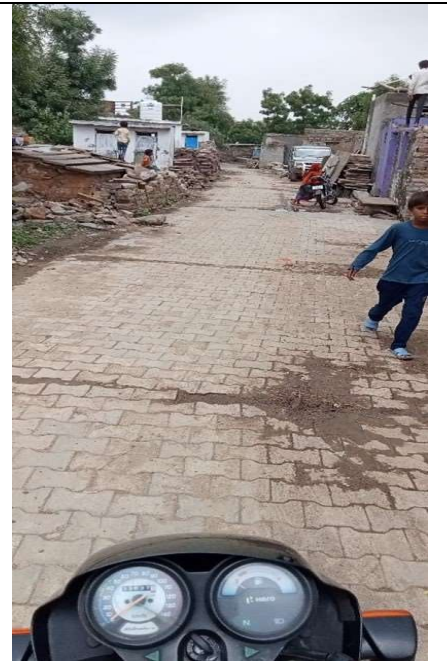
Interlocking tiles, Budhpura (2 years old) In this village, people mention that there is a requirement of road in Majit Colony and PM Awas is delayed and there is water problem too.