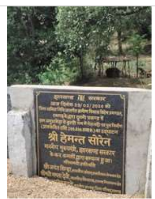
A Bridge over River connecting Jamuabeda to Kulhi

Uncommon Cause - Footpaths with no takers!