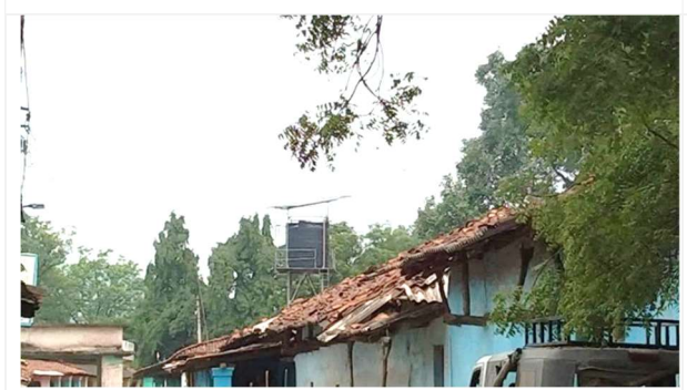
Not working properly, people are dissatisfied with its intermittent working.