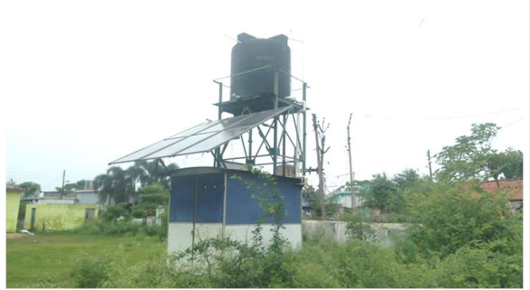
Battery is not there from last several months. People say it should have been in near the habitations. So it's just a standing asset with no utility. Village Bayang, Raigarh Block. Purified water is required in the village