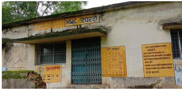
People complain about dilapilated health facility in Taparda of Pursour Block. It must be repaired with immediate effect.

Regularisation of water supply must be ensured, in absence of proper supply people face difficulties to perform daily household chores. Village Taraimal, Block Tamnar