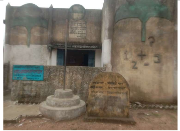
Anganwadi (Village Diprapada, Parsada) built in 2017-18, the photo speaks of maintenance!