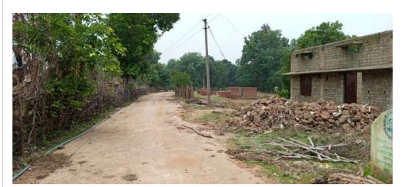
This Samudayik bhawan in Village Mhuahar, Panchayat Kerakachhar is delayed