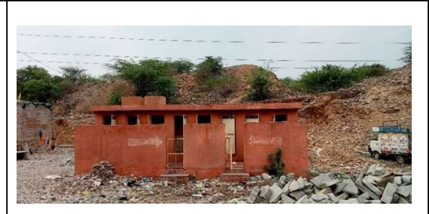
No water facility in this toilet complex in Budhpura mines