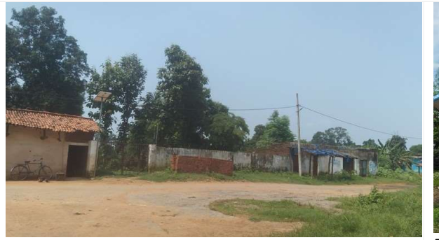
This solar lighting project in Sambalpur village of Raigarh block has many of its lights defunct.