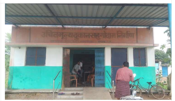
This PDS Godown is far from most of the habitations of Village Bayang of Raigarh Block destined to benefit more than 2000 people

Construction of Stage at Navodaya Vidyalya Bhupdevpur (Block Kharsia) Raigarh was proposed in 2018 at Rs. 5.42 lakh. On visiting the village, it was not found to exist on ground.