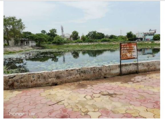
Pondibahar talab conservation work, Pondibahar, Korba - None uses it. Quality of work seems bad