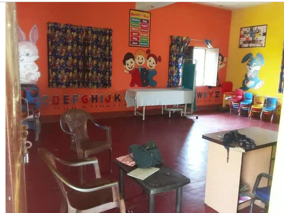
Model Anganwadi Centre in Tandwa looks impressive. But there is no water and electricity connection pointing to inter department coordination and provision of essentials like water and sanitation