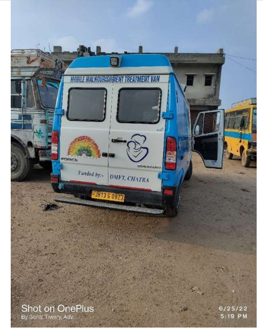
Makes awareness about malnourishement. Conduct survey and organise camps for malnourishement in the chatra. Especially in PVTG area.