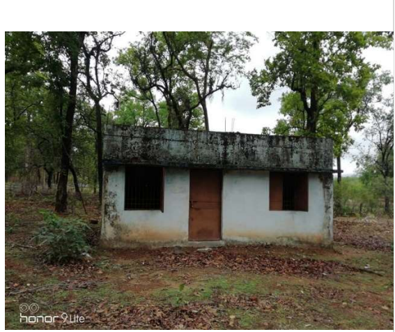
Elephant Assistance Centre in Village Futhamuda, Bela, Korba stands by itself