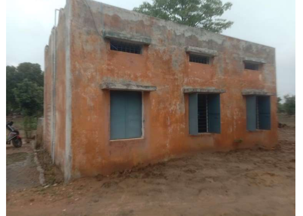
Anganwadi in Mauharbhatha of Parsada Panchayat of Pali block. It seems site selection was not discussed during project formulation