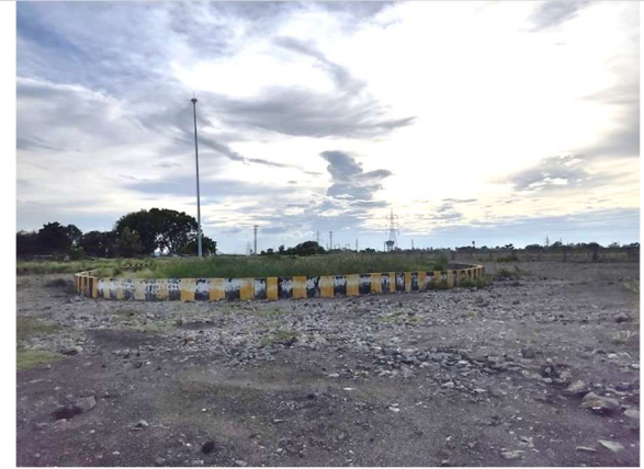
Construction of Truck Terminal/Parking Near Tarkera(Rourkela) Grid Left Side Of NH-143: Current land is coming under the surrender land (Rourkela Steel Plant surrendered to State Government) which is subjudice under NCST commission