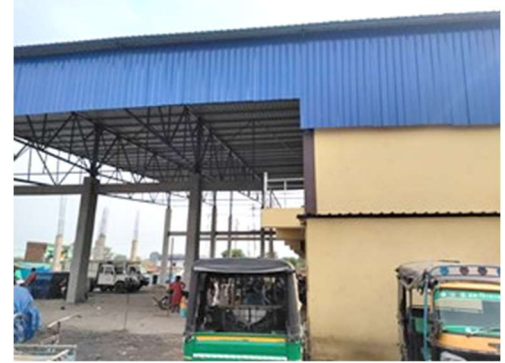
Development of Gola Market of Gola Block which is a commercial project at a estimated cost of Rs. 5 Crore. Whether such projects be developed under DMF? Will the affected get shops in this market?