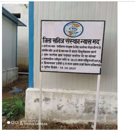
The name itself suggest that this facility is for Nature Camp (Satrenga, Korba) which is approximately 35 kms from the mining area in Korba. This has costed Rs. 30.85 Lakh