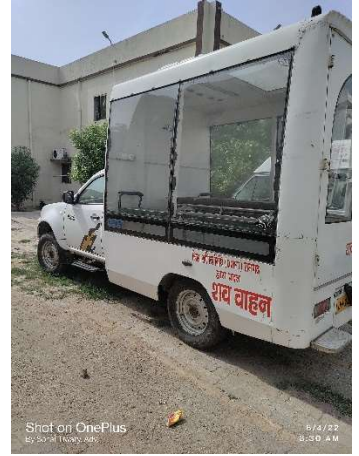
Cradle to Grave! Infrastructure is such a wide term to include everything under its stride.