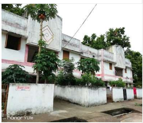
Residential Building, Lemru, Korba at Rs. 39,40,000