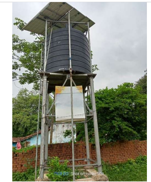
Solar energy based dual pump in Village & Panchayat Kudheikala, Lahunipara. Pump isn't working. Repair required