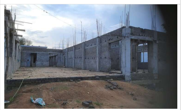
Barhaband High school is being built in Gauchan land in 20 decimal area. Whether it affects rights of people and will it serve its purpose in small place is a question. Participation seems to be a far cry!