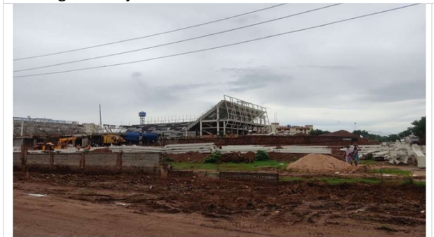
Built at a cost of Rs. 1368.25 million, this International hockey stadium is being built in Sundergarh's Rourkela Town