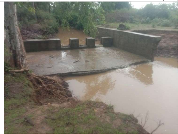
This stop dam work in Badekachhar nala of Panchayat Parsada in Pali Block was erected without taking suggestions from local community