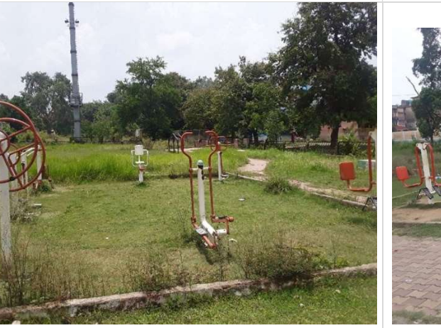
Open Gym, Sector 4D, Bokaro