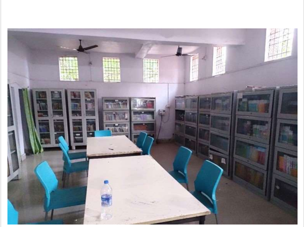
District Library Chatra: Built at a cost of Rs. 75 Lakh. New books are lacking. No regular newspaper. People working have not received salary for last 16 months.