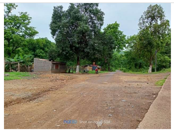
Construction of Jamudihi Road to Barsuan road, Gaganaposh of Chordhara Panchayat (Koida). It has damaged fast and requires attention.