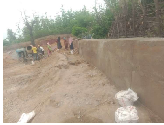
Returning wall (Shiradi Jhorki Pond) in Village and Panchayat Saraipali in Block Pali is delayed.