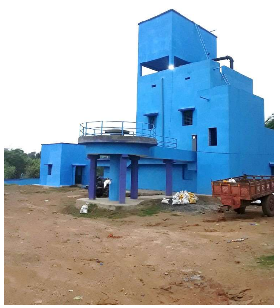
Pumping station, Swang Project (see next page)