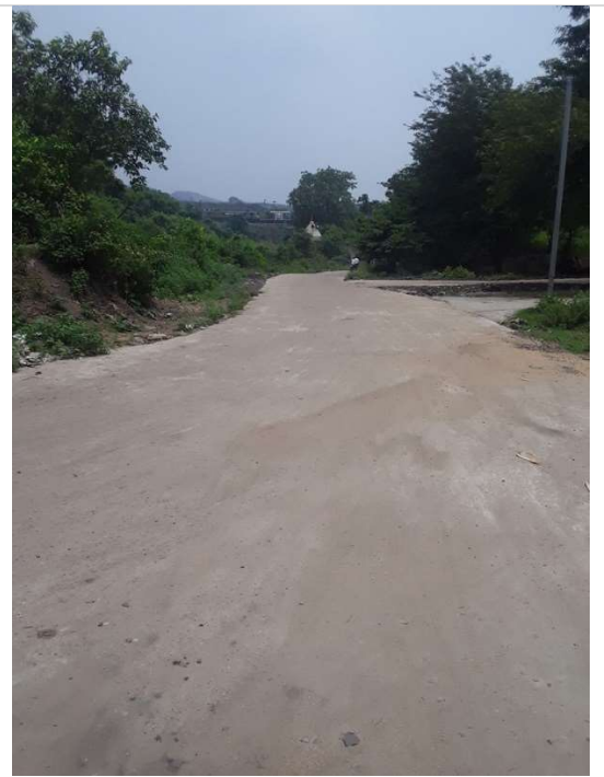
PCC Road from Jodia Bridge: The quality of this road seems compromised in Jaridih East of Bermo Block, Bokaro