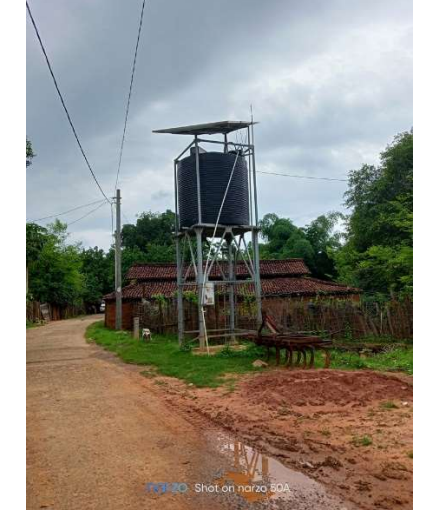
Solar based Drinking water supplyin Village & Panchayat Pithachor (Bonaigarh) is lying defunct, requires maintenance