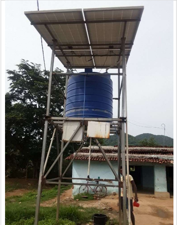
Solar Drinking Water, Panchpandav, Devdaria, Kisko