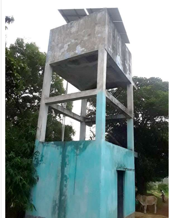
Water Supply Scheme Bagad (Jamun Toli) Bagad Kisko