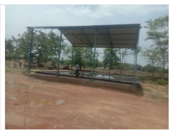
A place to collect paddy produce in Gram Panchayat Nirdhi (Pali Block) has wet floor after rains. The design issue leads to leakage.