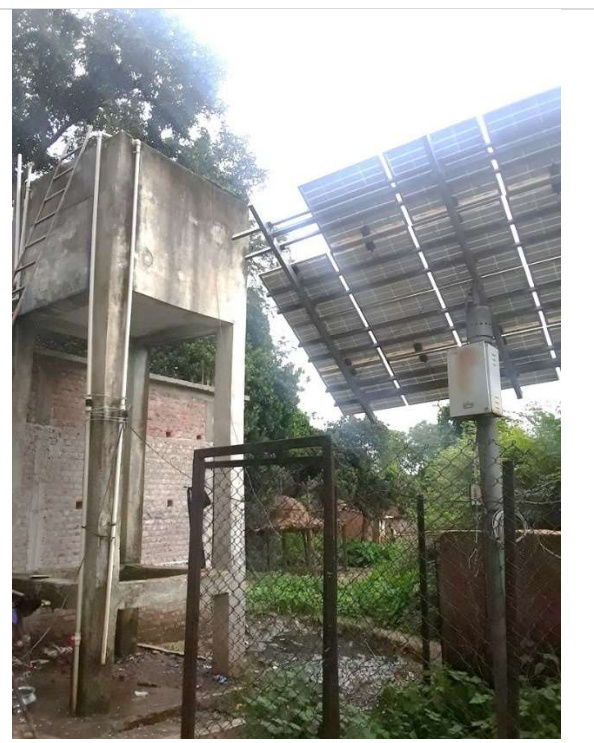
Solar Based Water Supply, Kocha, Kharki, Kisko – Not Working properly