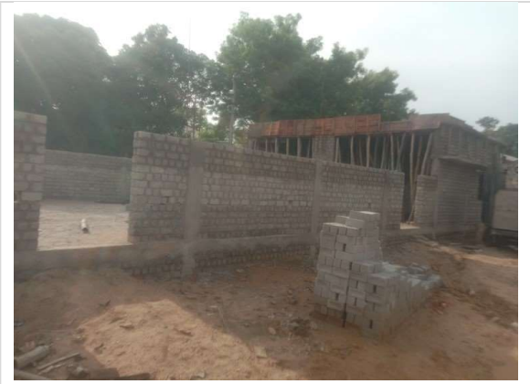
Gram Panchayat Kerajharia awaits completion of various construction works in Swami Aatmanand School of Excellence - Under construction, must be completed fast to provide benefits to the people of the areas.