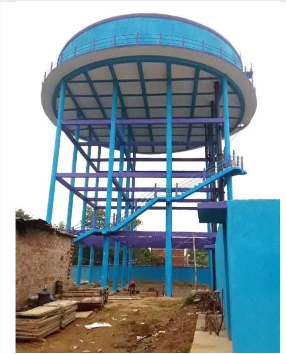
Swang Drinking water supply scheme at a cost of Rs. 9 Crore in Swang South Panchayat. 4-5 villages will get benefit from the scheme (Swang, Kenduakocha, Pipradih, Karmatia)