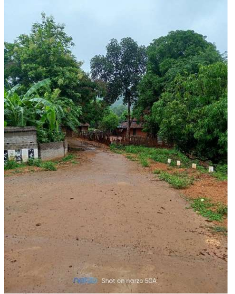
Nuatantra school to Kastutola road work will benefit 2 villages including Tantra & Kastutola of Chordhara Panchayat (Koida). Road quality should be maintained