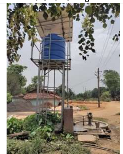
Working but O&M improper. (Beyand Village of Kulhi Panchayat)