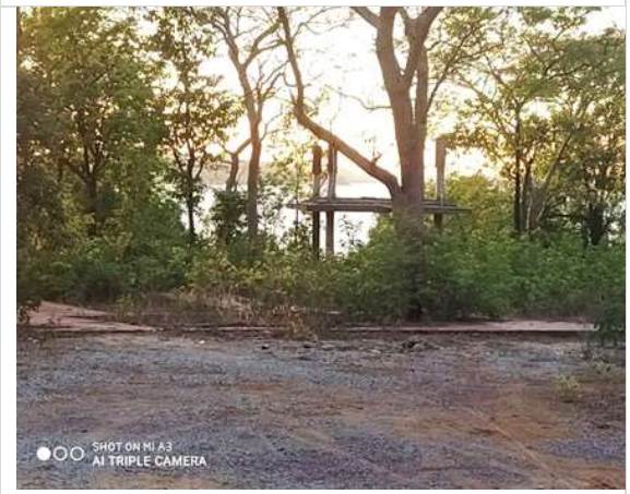
Plantation cum Garden, Satrenga, Korba. This is a tourist attraction and not an affected area by mining. Built at a cost of Rs. 20L