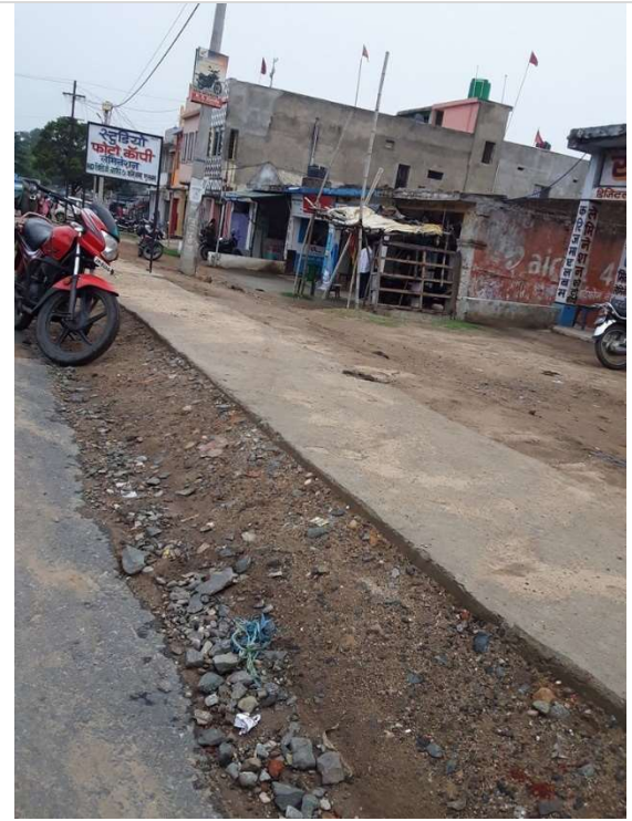
Inappropriate Drain Construction – Built in Swang South of Gomia Block, Bokaro.