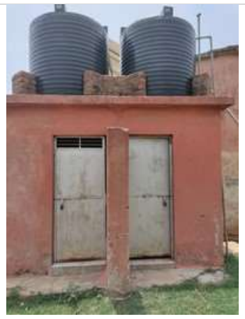
Toilets remain locked, Favours asked to let get some water (Kulhi, Ramgarh)