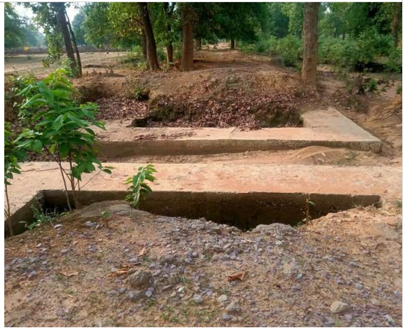
Culvert awaits completion. Work is incompleted in Ludo Khete village of Chachiya Panchayat.