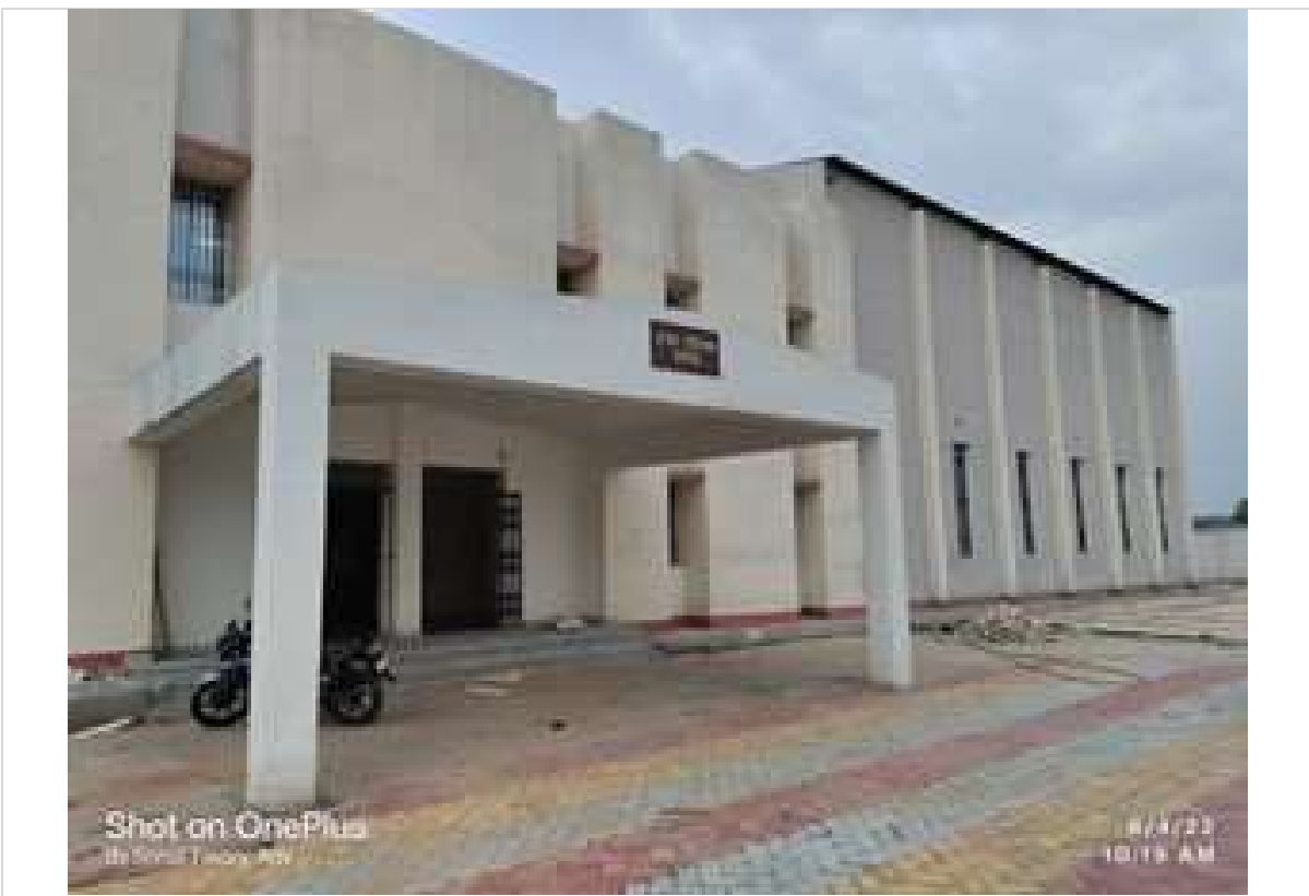
Indoor Stadium built in Chatarmandu Village and Panchayat at a cost of Rs. 3 Crore. How projects are prioritised by the Trust is questionable?